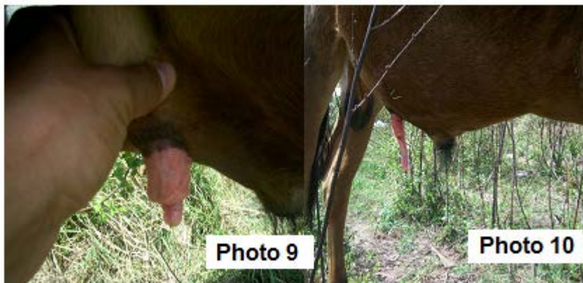
Fig. 3. Exploration 10 months after surgery (photos 9 and 10).