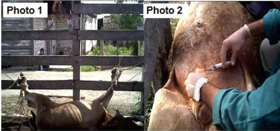
Fig. 1. Immobilization (photo 1). Local infiltration with 2% lidocaine (photo 2)